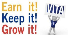
Volunteer Income Tax Assistance Program

The Volunteer Income Tax Assistance (VITA) program is a free service offered to low-income individual, and families who qualify for the Earned Income Tax Credit. This service is available by APPOINTMENT ONLY! Appointments can be scheduled by calling Community Teamwork Inc. (CTI) at (978) 654-5676 or Mills42 Federal Credit Union (978) 328-5100.